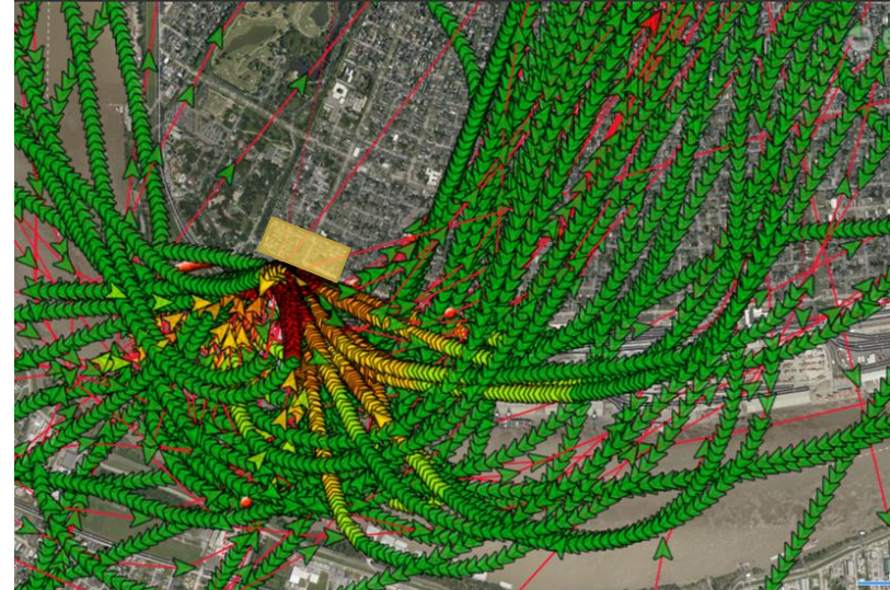
The yellow box indicates the neighborhood zone for flight avoidance whenever possible, as previously communicated.