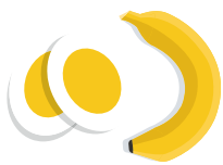
Breakfast prescribed dose