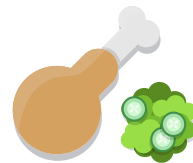
Dinner Prescribed dose