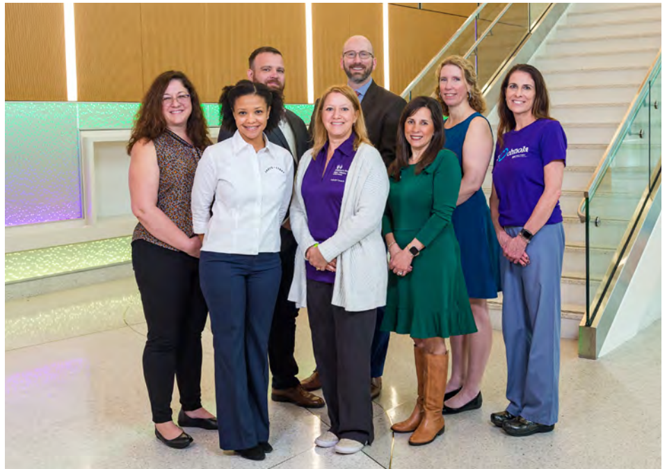
The Children's Hospital Patient Family Advisory Council

The council is currently working to provide transitional care information for Children's patients as they transition from pediatric care to adult physicians. At a recent PFAC meeting,