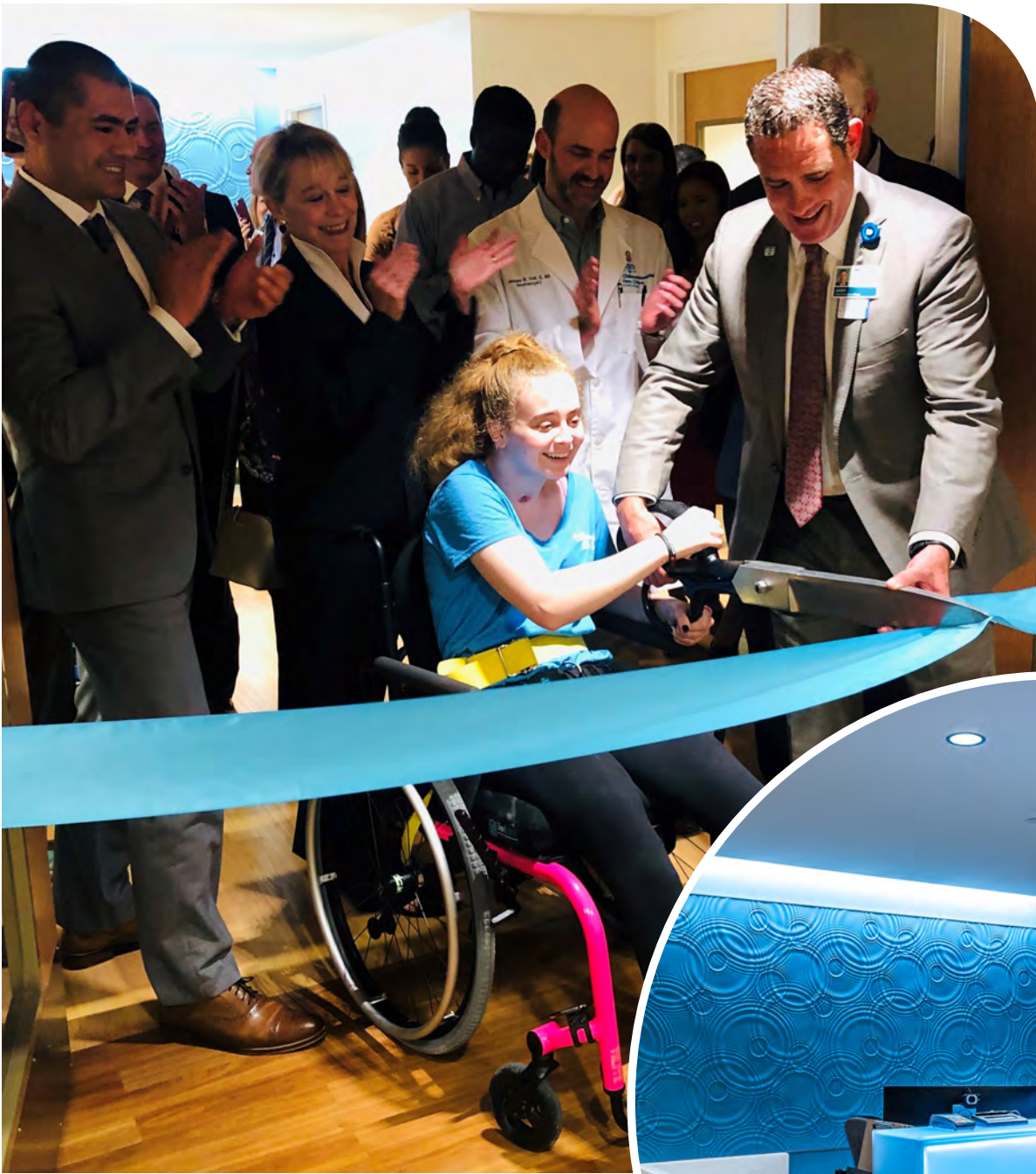
Opposite page: The new entrance to the Neurosciences Clinic. Left: The Neurosciences team celebrates the opening of its new clinic with a ribbon cutting celebration. Below: Neurosciences Clinic reception area provides a warm welcome for families.