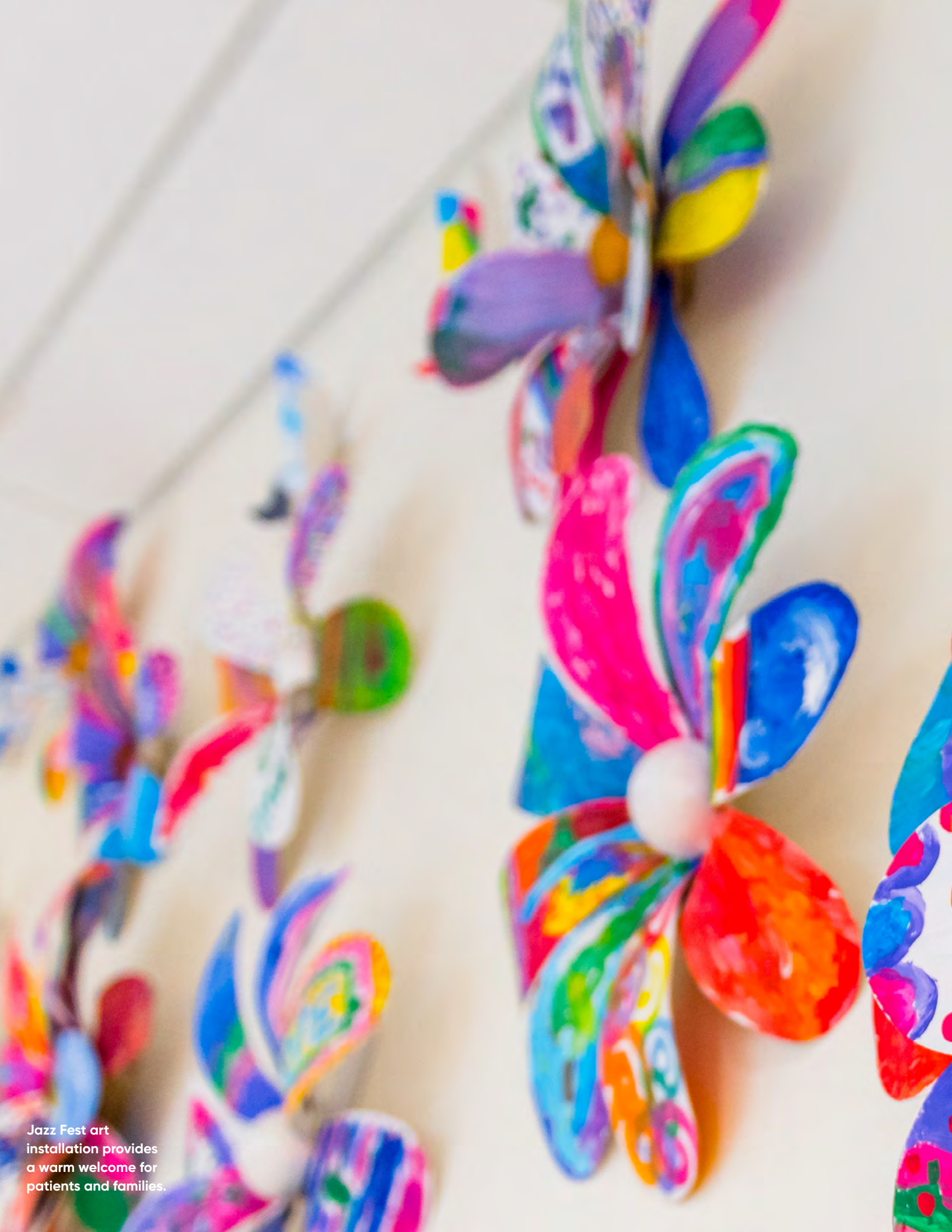
Jazz Fest art installation provides a warm welcome for patients and families.